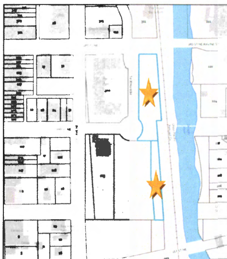
EXHIBIT A DEPICTION OF THE PROPERTY

Staff worked with legal counsel to determine the proper means to transfer the land. As part of that process – it was identified and suggested that both Outlot B and D of River Ridge Addition, be included in the transfer. Minnesota State Statutes 469.029 and 471.64 provide the applicable provisions that allow the transfer to occur via Quit Claim Deed. The conveyance of both parcels is in the best interest of the public.