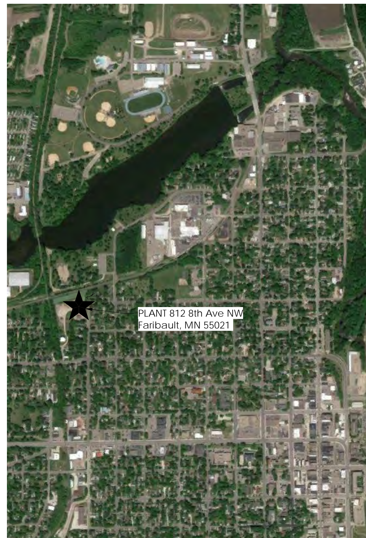
PROJECT VICINITY MAP