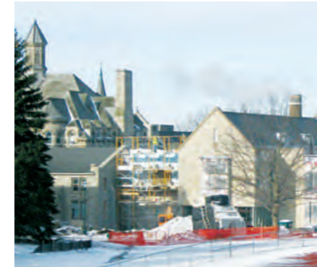
Fayfield Hall – Shattuck St. Mary's Campus