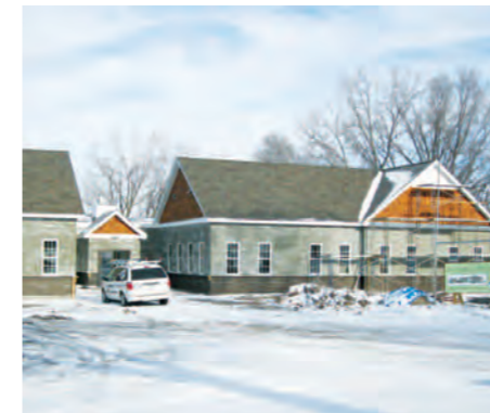
STEM Middle School Village