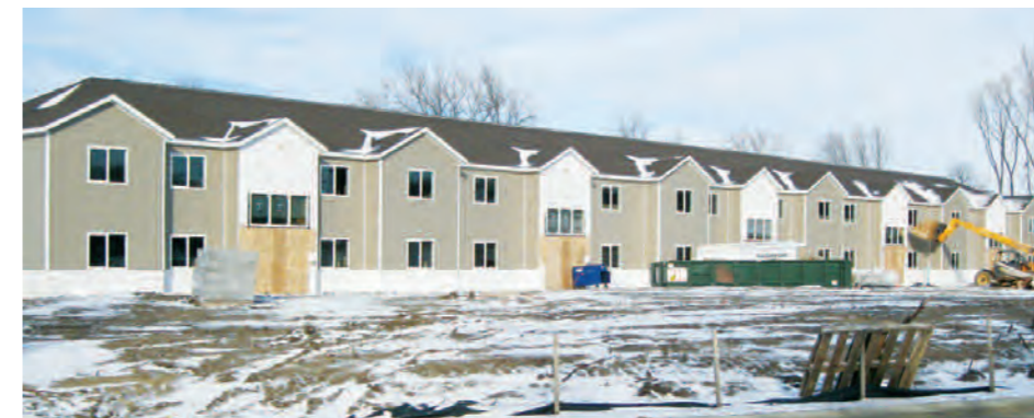
Cashin's Park Avenue Apartments