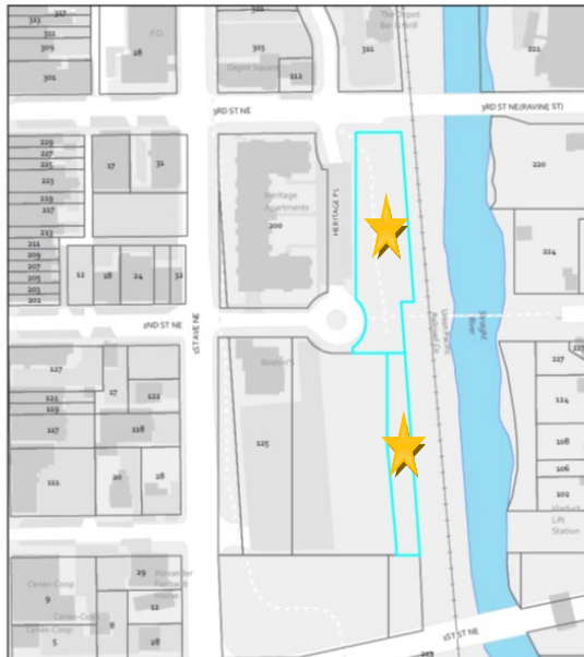
EXHIBIT A DEPICTION OF THE PROPERTY

In August 2018, the EDA conveyed Outlot B and D of River Ridge Addition to the City. A city trail is location on the land, the land serves as a linear park, and the City (not the EDA) maintains the trail and grassy areas. The conveyance was viewed as being in the best interest of the City.