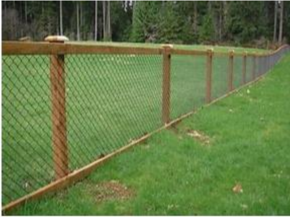
4' wood framed chain link OK in new Ordinance

Examples of fences allowed in the front yard area.