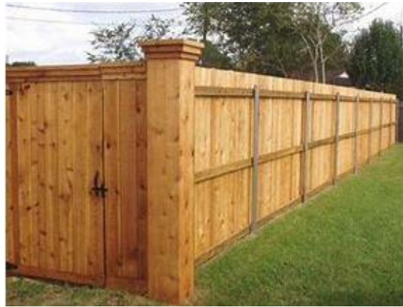
Framing on outside of fence is not allowed. Finished Side out toward neighbors is required.