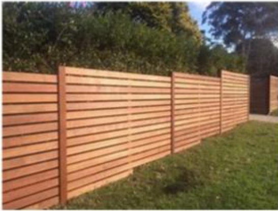
Slat Style Screening fence (both sides finished)