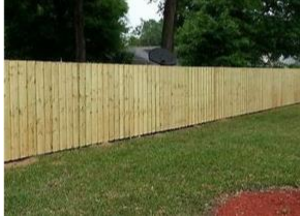
6' screening fence finished side out (allowed) New ordinance allows screen fences in corner side yards