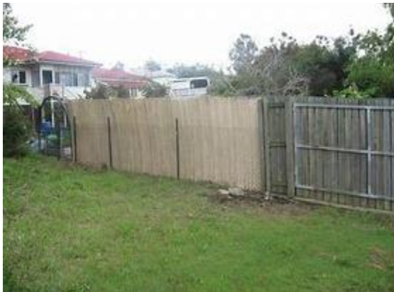
Ownership of the fence dictates finished side