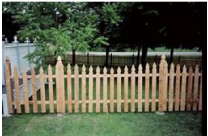
4' picket allowed in front yards