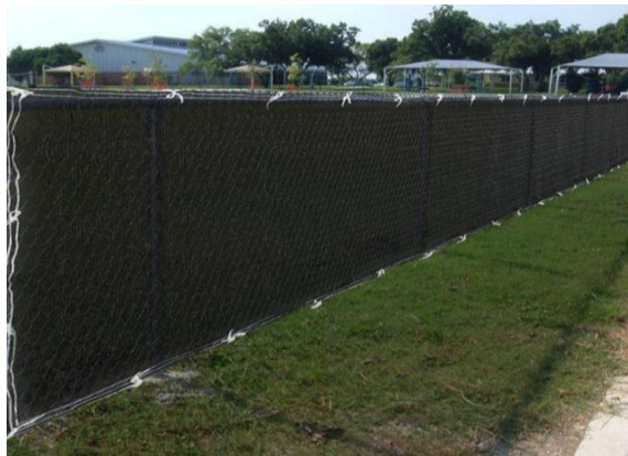
Example of 6' chain link with mesh screen (not allowed for residential uses)