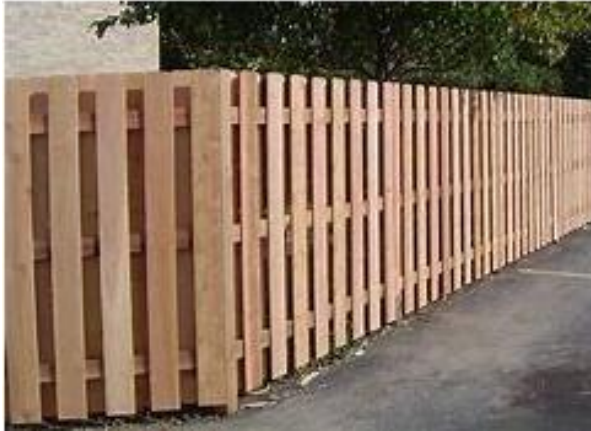
Shadow box style screening fence 6' Maximum. Both sides are finished with this style.