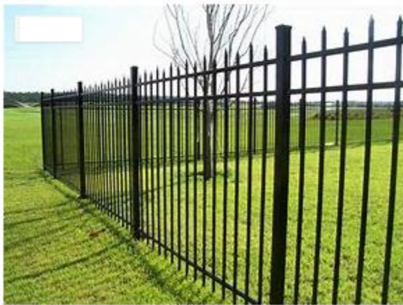
4' wrought Iron Fence allowed in front yards