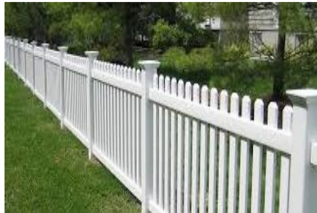
4' vinyl picket fence allowed in front yard