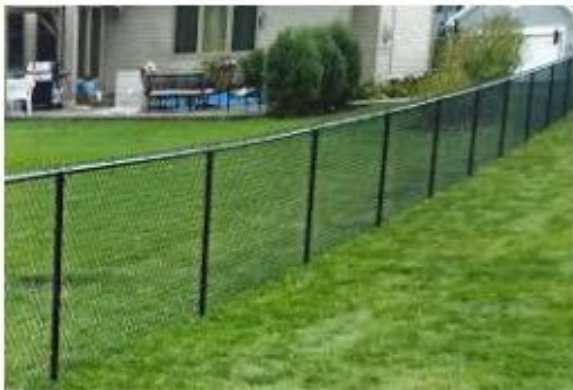
4' tall chain link fences will be allowed in front yards in new Ordinance, except in sight triangle areas where the limit will be three feet.