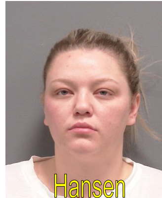
gree DWI. Her bail was set at $6,000 with conditions.